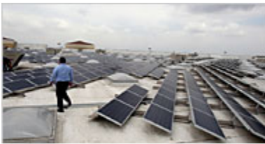
A Wal-Mart store in Chino, Calif. has both a cool roof and solar panels to cut its energy use.